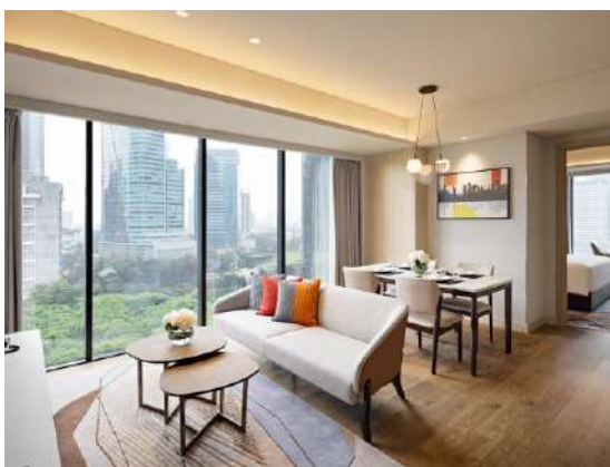
Living & Dining Area

As the first Swissôtel Living in Southeast Asia, Swissôtel Living Jakarta Mega Kuningan introduces a new standard of serviced living with a curated range of Studio, One-Bedroom, and Two-Bedroom residences. Each unit features a private kitchen with induction stove, in-room washer and dryer, and a spacious refrigerator—delivering a seamless home-away-from-home experience for both short- and long-term stays. Guests also enjoy access to thoughtfully designed shared facilities, including Embers Open-Fire Grill Restaurant, a full-service fitness center, a serene swimming pool, and an elegant resident lounge—each space crafted to elevate daily living with a touch of refined Swiss hospitality.