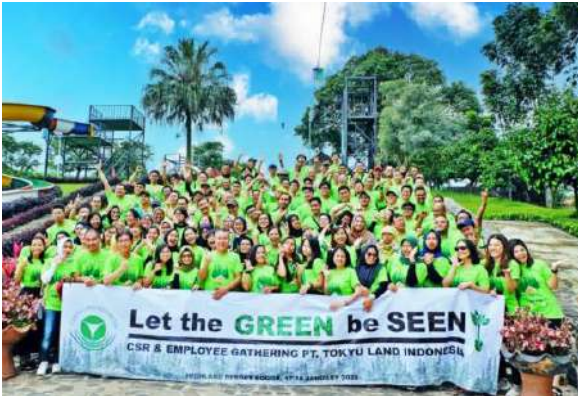
Tokyu Land Indonesia Employees

Since entering Indonesia in 1975, TLC has contributed significantly to the country's urban development, delivering over 5,000 landed homes and 2,200 condominium units. Following the establishment of TLID in 2012, the group has deepened its commitment by investing in real estate and fostering local talent through job creation and skill development. TLID also actively supports community well-being through CSR programs such as bike lane construction, COVID-19 vaccination support, tree planting, coral reef conservation, sea turtle conservation, support of people with autism and city clean-up initiatives across Jakarta.