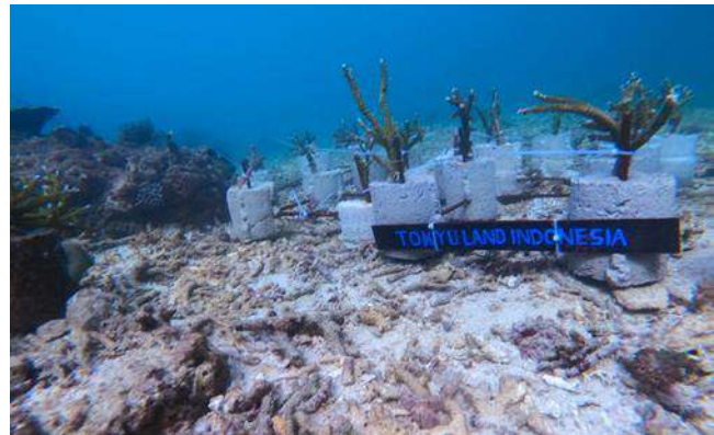
coral reef conservation