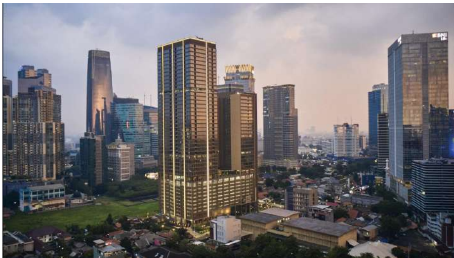
Exterior of the Mega Kuningan Project

Swissôtel Living Jakarta Mega Kuningan is part of a large-scale integrated development comprising condominiums, serviced apartments, and commercial facilities on a 10,000 m 2 site in Jakarta's Mega Kuningan district—an area undergoing significant redevelopment within the city's central business district. The project was designed and constructed by Shimizu Corporation, and is managed and operated by Tokyu Property Management Indonesia, a member of the Tokyu Fudosan Holdings Group. As one of the few "All-Japan" initiatives overseas, this project is fully led by Japanese companies across every phase—from land acquisition and development to design, construction, and management. With high-quality Japanese residential fittings and advanced technologies rooted in the Group's experience in Indonesia, the development introduces a new lifestyle concept to the city's growing urban landscape.