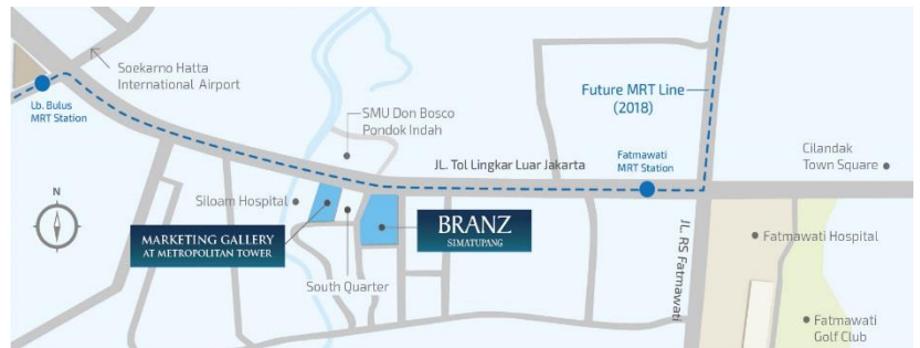
Map of Jakarta