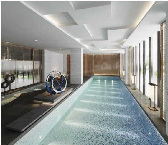
Indoor Swimming Pool (image)