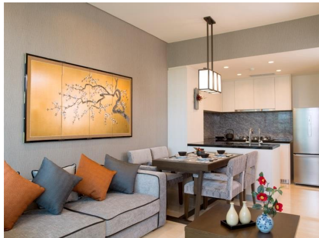
2BR Show Unit