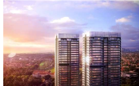
Completed Image of BRANZ SIMATUPANG