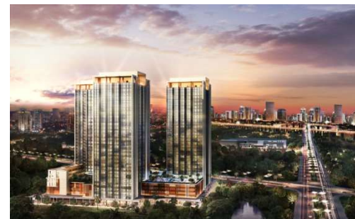
Completed Image of BRANZ BSD