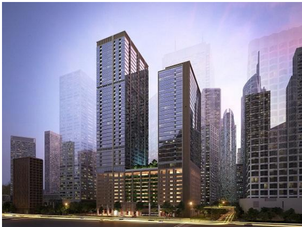
Overall exterior appearance (illustration)

The project which consists of condominium, rental housing, and commercial facilities, was developed jointly by involving the Japan Overseas Infrastructure Investment Corporation for Transport & Urban Development (located in Chiyoda-ku, Tokyo; hereinafter referred to as “JOIN”) whose capital originated from the Japanese government. The construction work is handled by Shimizu Corporation and will be carried out with an “All Japan” project organization structure by Japanese companies in an integrated manner from land acquisition, development, design, construction work, to operational management.