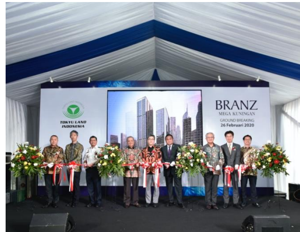
Photo session during Ground Breaking Ceremony